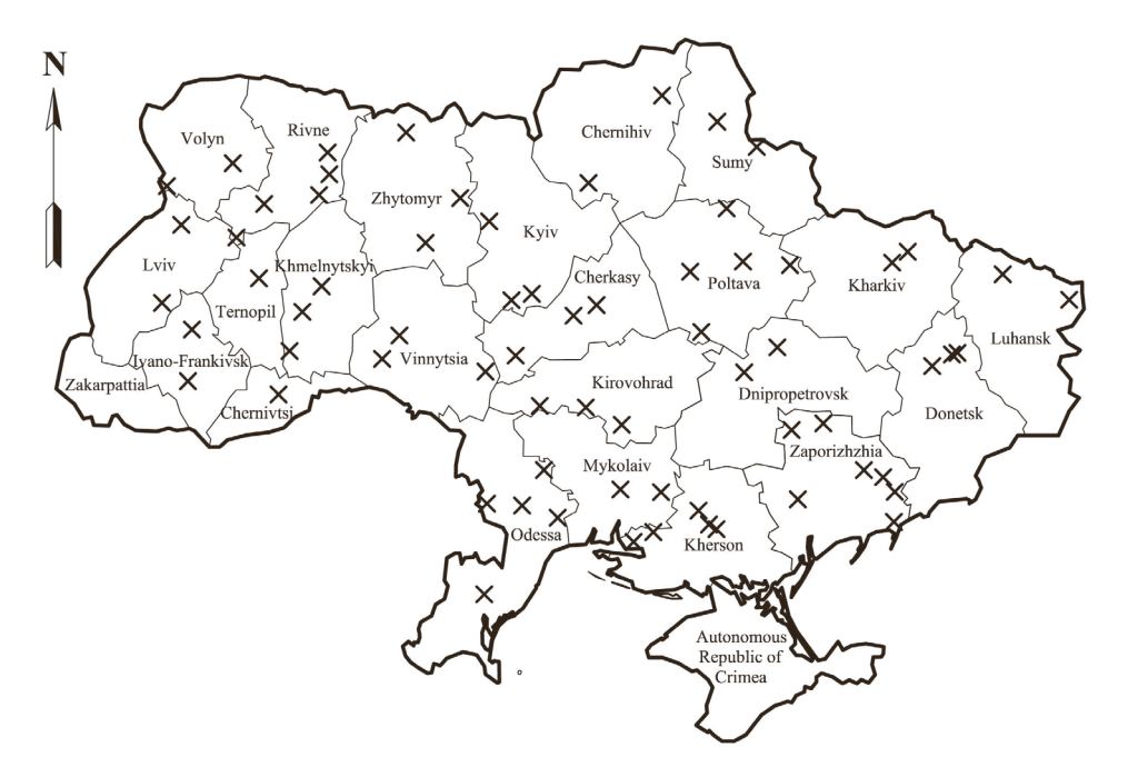
Fig. 3. Location of surveyed hromadas in Ukraine

agricultural issues. Sixty-eight surveys were returned in total. All of them were useable in the study. The two biggest challenges to getting surveys completed were (1) the quarantine measures due to the spread of the COVID-19, which made it impossible to organise summary face-to-face meetings and (2) developing a comprehensive questionnaire by the internal requirements of the Association.